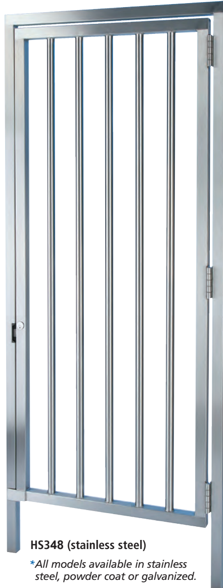
HS348 (stainless steel)

*All models available in stainless steel, powder coat or galvanized.