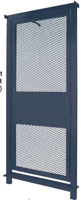
HS348 - Front (powder coat with mesh)

*All models available in stainless steel, powder coat or galvanized.